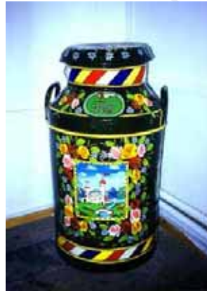
Combining the dual heritage of the canals and countryside; a Roses and Castles style enameled milk churn

leading any educational or leisure activities we would like to hear from you soon.