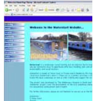
Home Page of our new high graphics website

rally, we are constantly updating, and adding to, our internet pages and would welcome your comments and suggestions. Our email address is: waterstart@btconnect.com