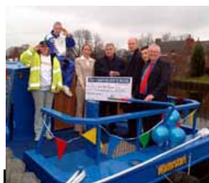
The official handing over ceremony, as depicted in the local press.

When we first started up the project just over a year ago we were unfortunate in not actually having a boat for our own exclusive use. After short periods of having first to hire the Andromeda, and then the Opportunity; both of which fell short of our specifications for a community boat, we are now glad to be able to report the details of our barge, which we hope many of you will be cruising on during the forthcoming months. The keys to our new boat, which we have named 'Waterstart' after the project itself, were handed over at an onboard